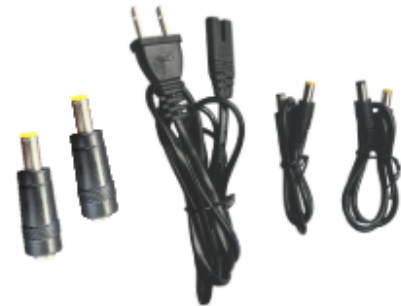
*Includes 2 adapters, 1 AC Power Cable, 2 DC Cables